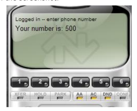
Figure 1-3 <Finish>