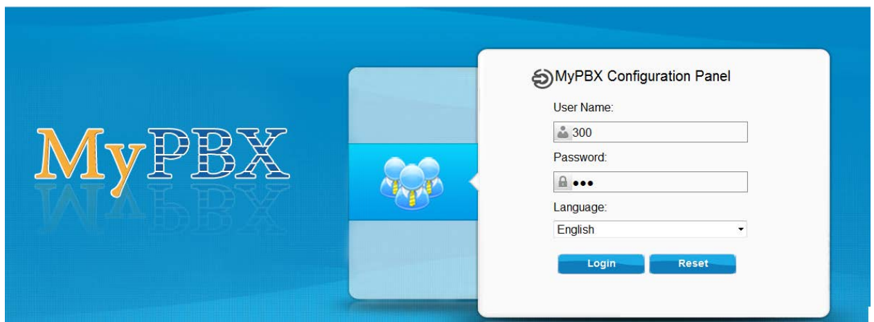
Figure 1-1 Login Page